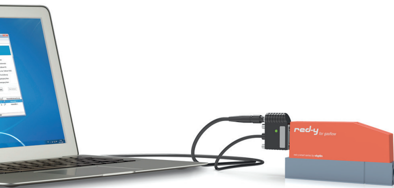
Fig. 2 red-y smart controller:

The high precision and fast regulation of the thermal mass flow meters and mass flow controllers is remarkable. The free get red-y software runs on any PC with a Windows operating system.