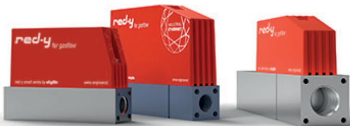
Fig. 2 red-y smart meter & controller:

The high precision and fast regulation of the thermal mass flow meters and mass flow controllers is remarkable.