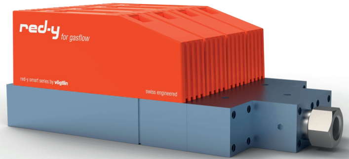
Fig. 3 Vögtlin offers modular MFC systems based on your demands and requirements.

Vögtlin mass flow controllers compensate for changes in ambient or gas temperature through automatic temperature compensation. This significantly improves repeatability. MEMS technology ensures long-term stability without deviations under the condition of a clean and dry gas supply. Flame recipes, depending on the glass product, as well as the specific process step can be defined and called up as desired.