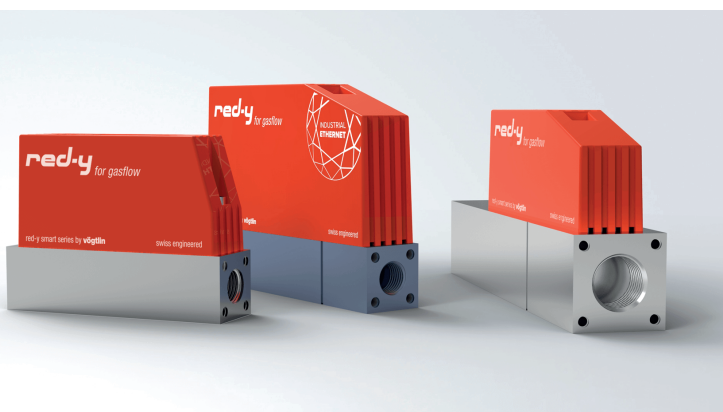
Fig. 2 In order to produce high-quality glass vials, measurement accuracy and pressure and temperature independence is required. The MEMS technology of the red-y smart series ensures long-term stability without deviations under the condition of a clean and dry gas supply.