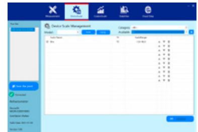
Software supplied with the DBR 95, for remote control and creation of customized scales