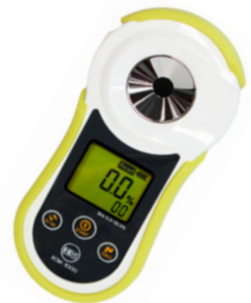
DBR 55 / SALT